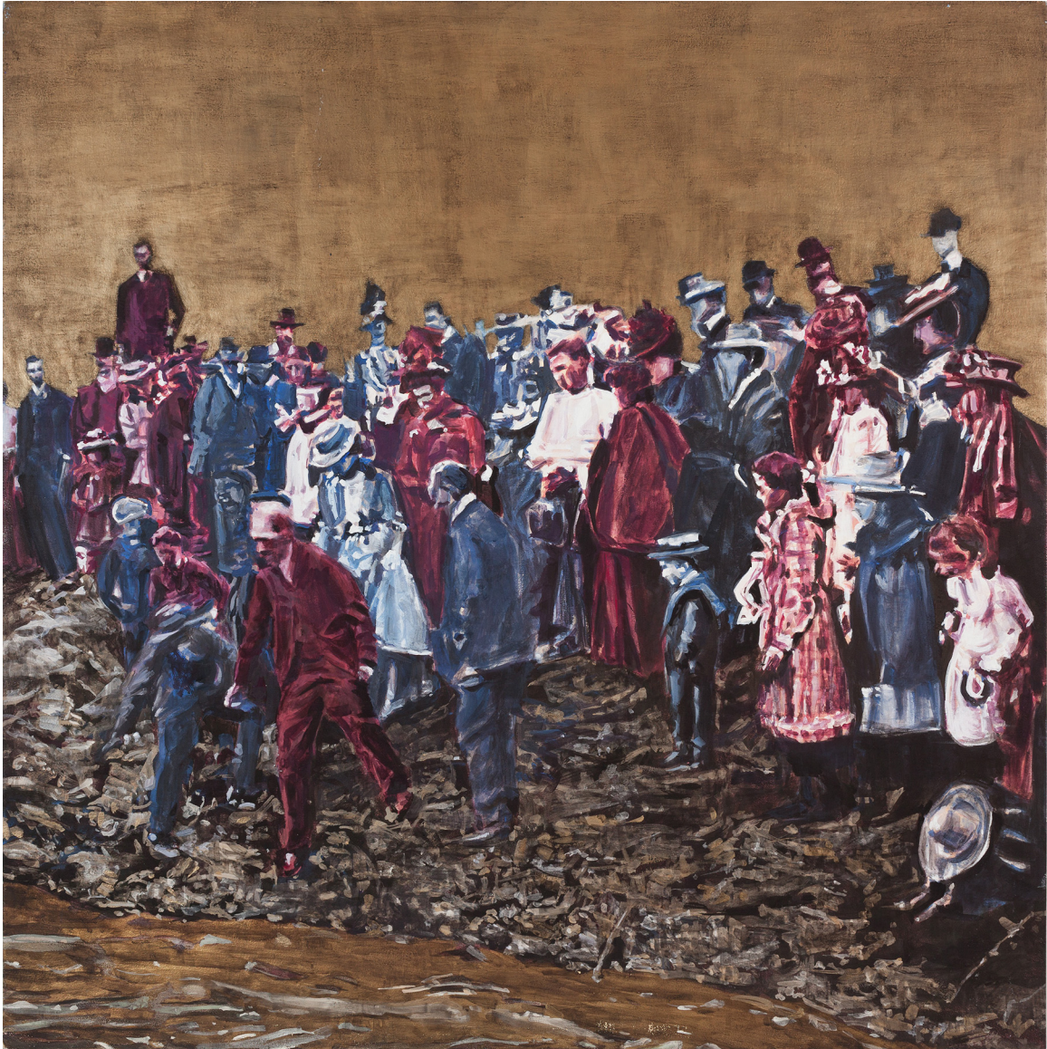
Stephen Batura, Overlook , 2016, acrylic, silver leaf on aluminum panel, courtesy of the artist