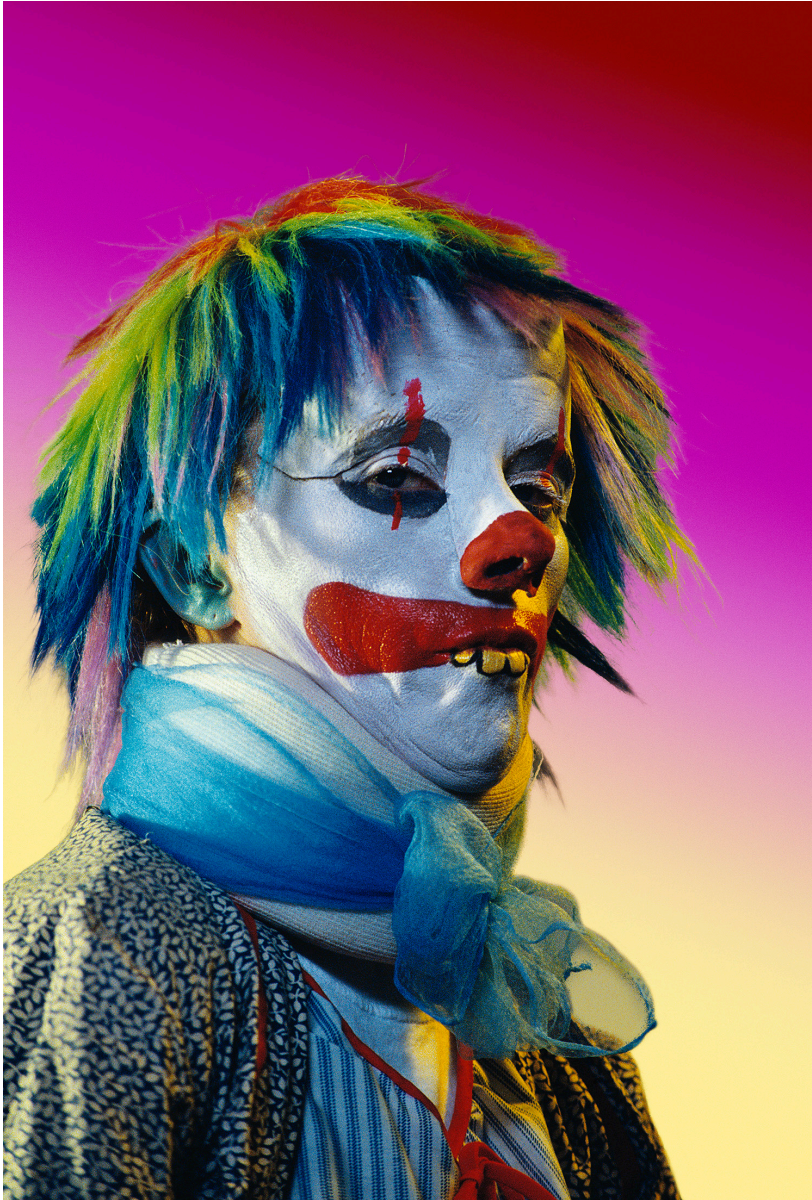
Cindy Sherman, Untitled , 2003, Chromogenic color print, (MP# CS-411)