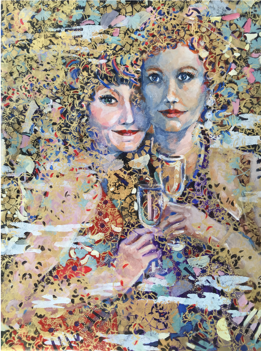
Sara Ware Howsam, Debutantes Dreaming , 2015, acrylic mixed media on canvas